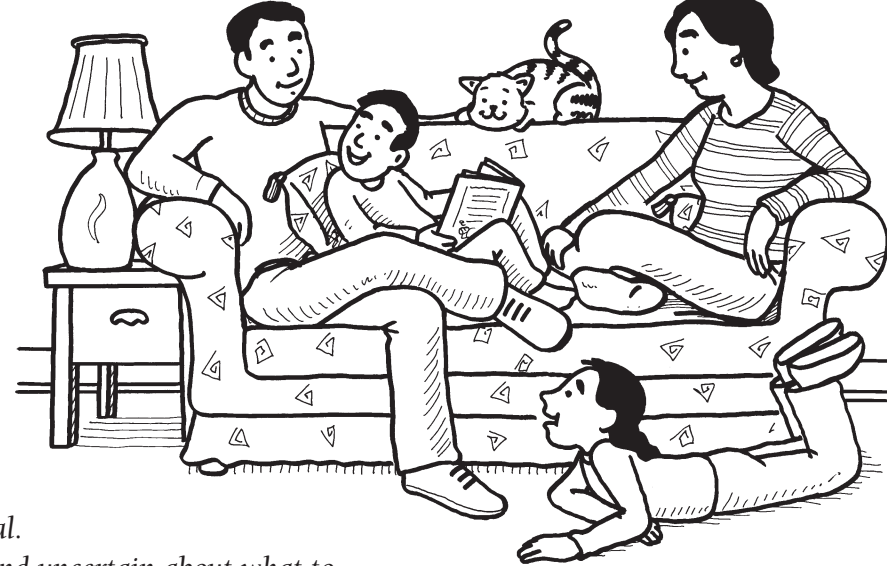
Editor's note: Guidelines are changing rapidly. Make sure to follow all local, state, and federal laws and recommendations on social distancing and other practices when using these ideas.

As a parent, you may feel overwhelmed and uncertain about what to do. Use this guide as a starting point for supporting your youngsters emotionally and academically during the coronavirus pandemic.